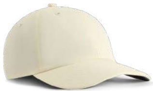
PALE YELLOW BPY