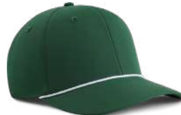
FOREST GREEN/ WHITE IXW