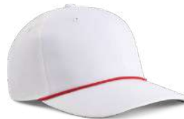
WHITE/ RED A14