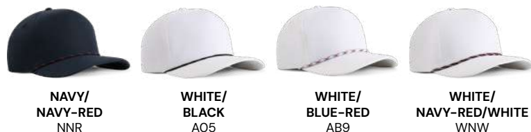
NAVY/ NAVY-RED NNR

WHITE/BLACK A05 flat embroidery (domestic/Empire)