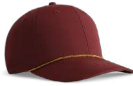
BLACK CHERRY/ DEEP GOLD JC1