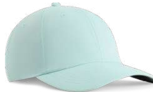
ROBINS EGG REG