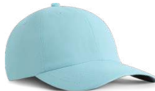
LIGHT BLUE HO8