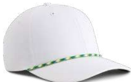
WHITE/ GREEN-YELLOW AG9