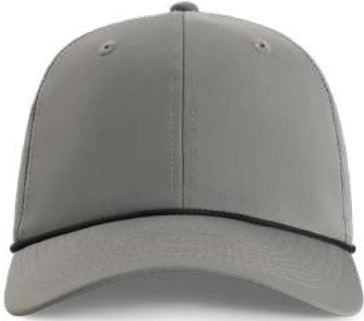
Curved Examples: X210P, X210B, 7054N