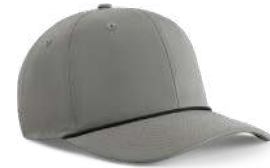
GREY/ BLACK J12