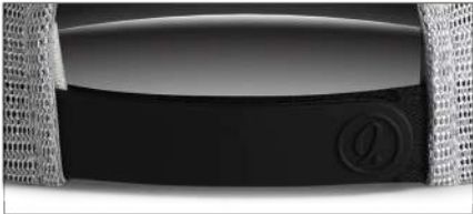
Rubberized Hook & Loop Examples: Lab Series, 1988, 4070