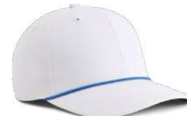
WHITE/ ROYAL AH2