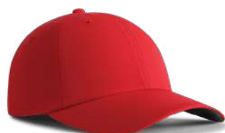
TRUE RED TRU