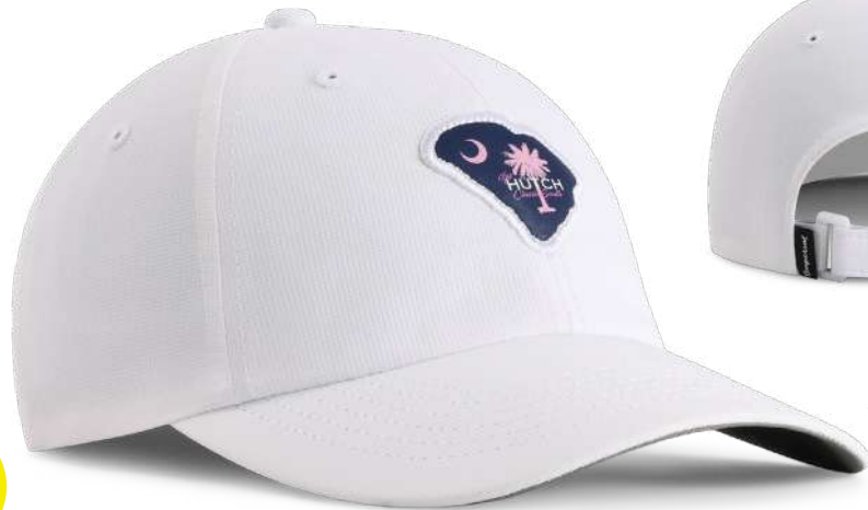
WHITE AXX transfer twill patch DTT (domestic only)