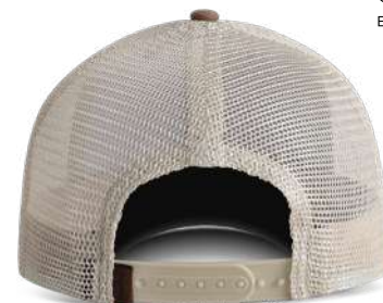
WALNUT/STONE WLS sublimated faux suede emblem PPSF (domestic only) P-DL-ND375