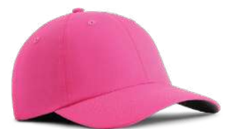
HOT PINK F15