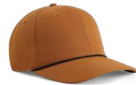
BUCKTHORN BROWN/ BLACK BNK