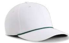
WHITE/ DARK GREEN ADG