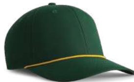
FOREST GREEN/ GOLD IXG