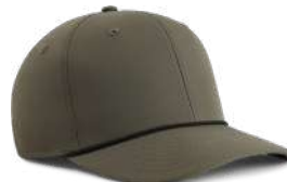
OLIVE/ BLACK I94