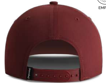
BLACK CHERRY/DEEP GOLD JC1 3D embroidery (via Empire program)