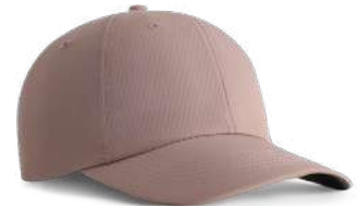
SMOKEY TAUPE SMT