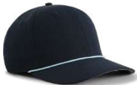
NAVY/ LIGHT BLUE HX8