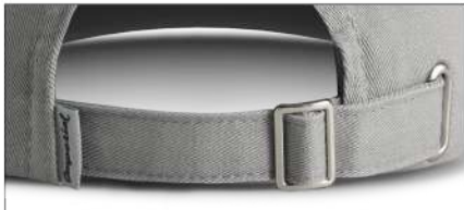
Buckle Slider & Grommet Examples: X210B