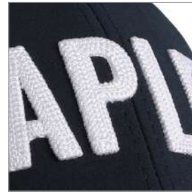
3D CHAIN-STITCH BLOCK*