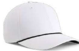
WHITE/ BLACK A05