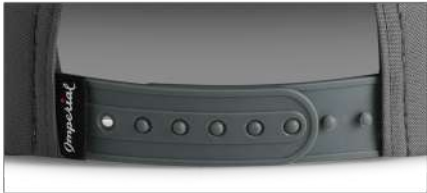
Snapback Examples: 5054, 7054, 4062