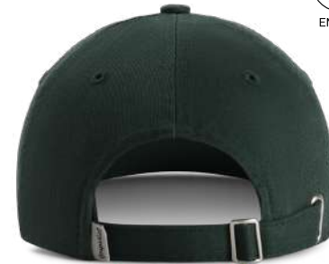
DARK GREEN IX1 3D Micro Patch PMP3D (domestic only)