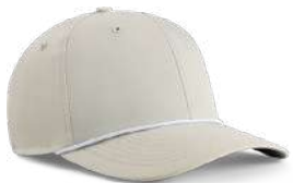
PUTTY/ WHITE PTW