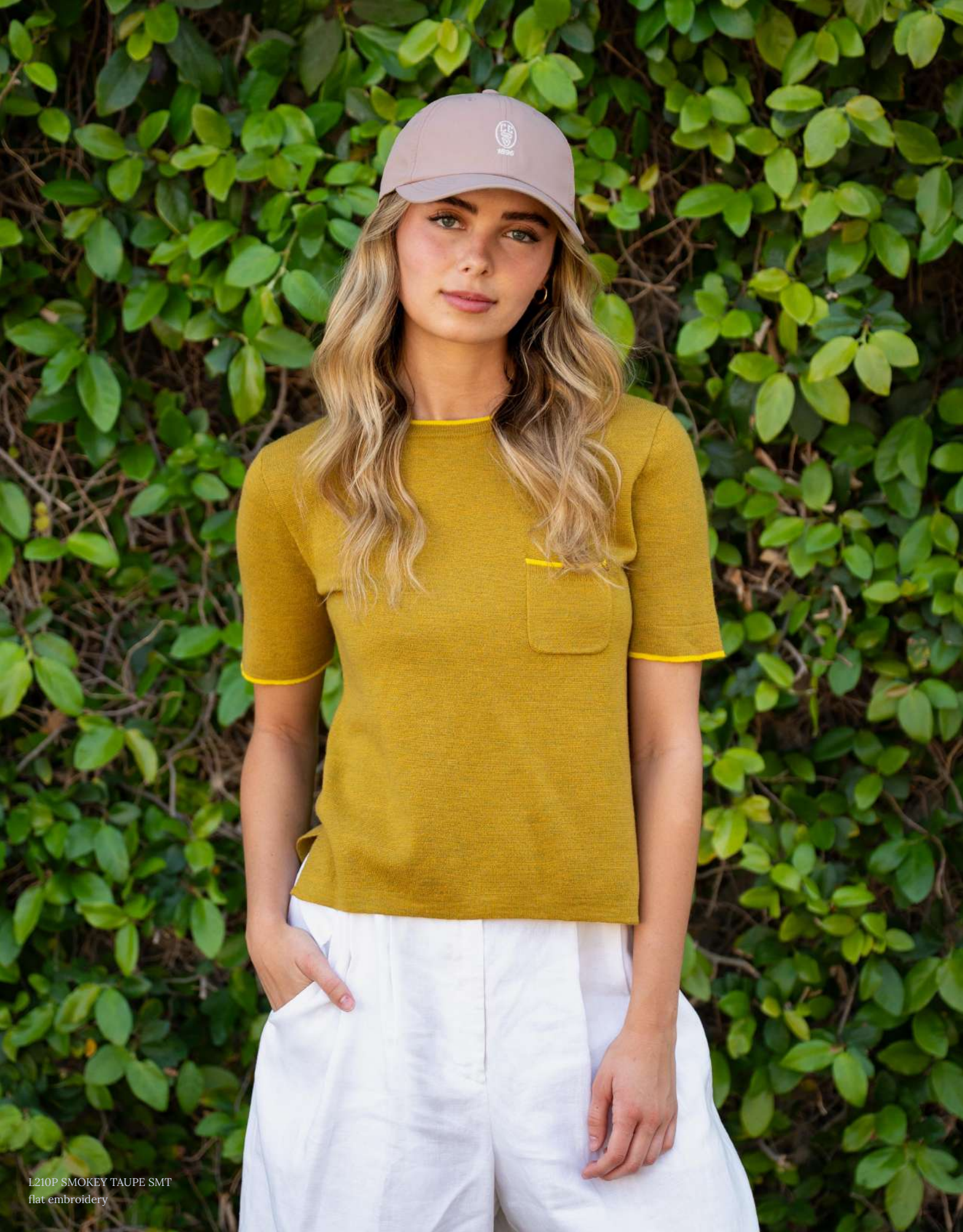
L210P SMOKEY TAUPE SMT flat embroidery