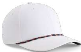
WHITE/ NAVY-RED-WHITE WNW