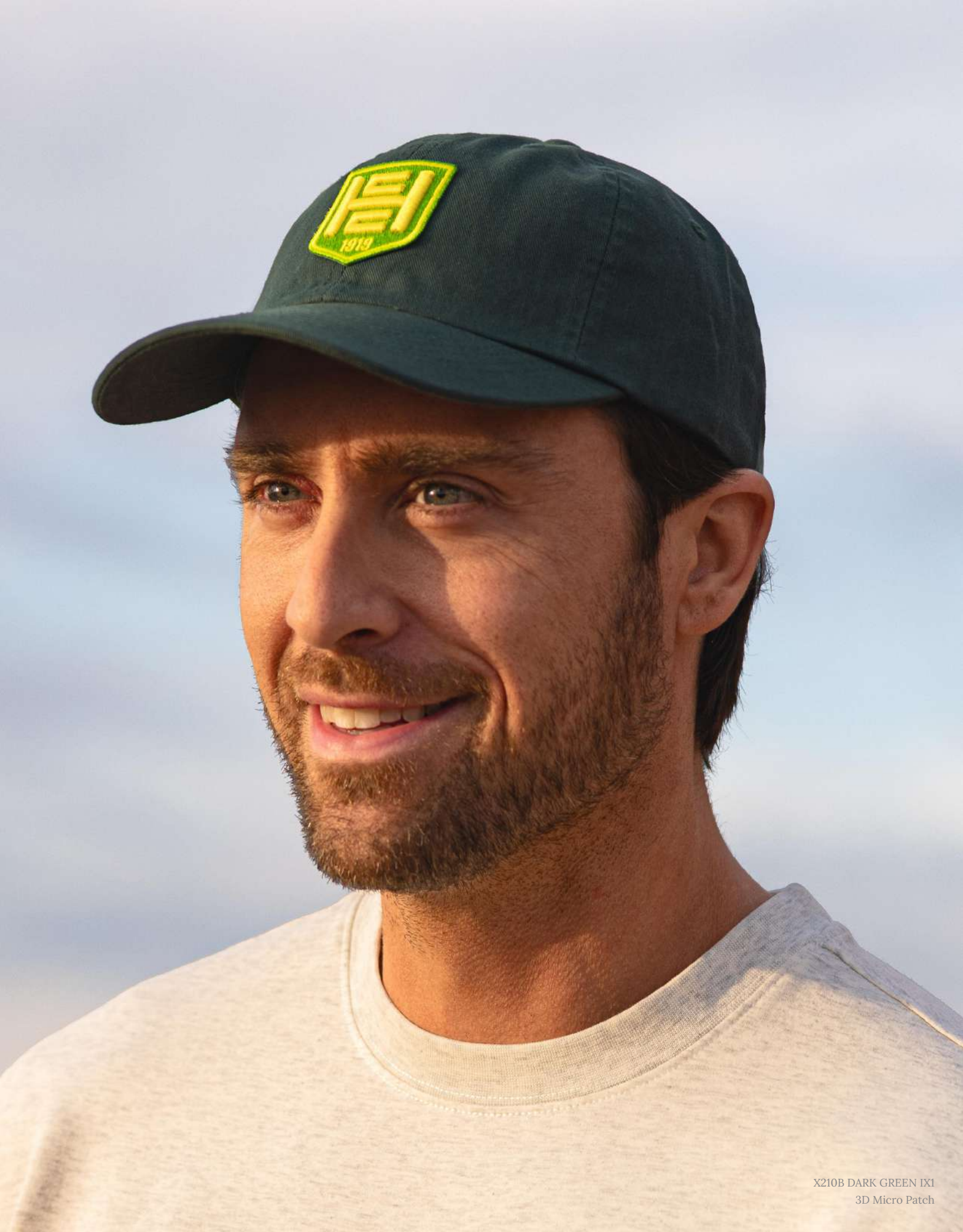
X210B DARK GREEN IX1 3D Micro Patch