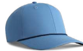
POWDER BLUE/ NAVY PWC