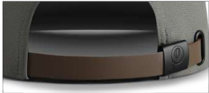
Clamp with Grommet Examples: DNA001, DNA014, 5462