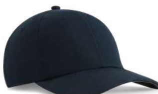
TRUE NAVY TNV