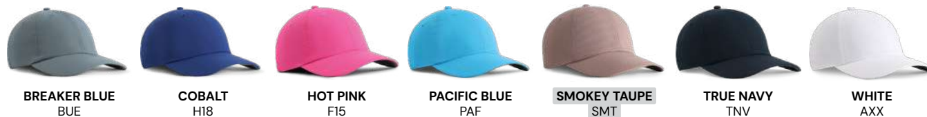
BREAKER BLUE BUE