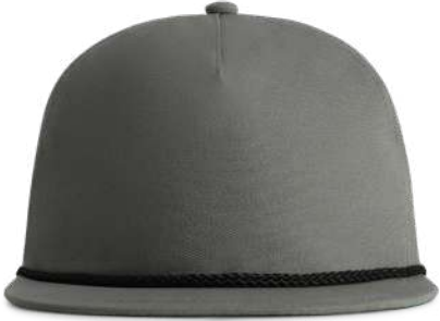
True Flat Examples: DNA001, DNA014