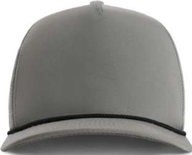
Slight Curve Examples: 5054, 5054U, X240M