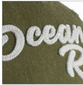
3D CHAIN-STITCH SCRIPT*