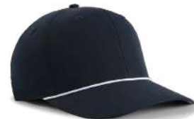
NAVY/ WHITE H41