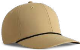
DEEP GOLD/ BLACK BDB