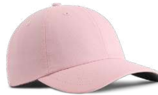
LIGHT PINK FLP