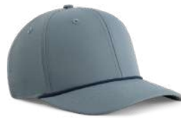
BREAKER BLUE/ NAVY BNA