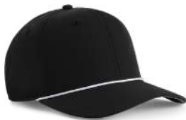
BLACK/ WHITE JAX