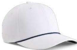
WHITE/ NAVY A21