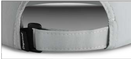
Hook & Loop with Garage Tuck-in Examples: X210P, IMP6, L210R